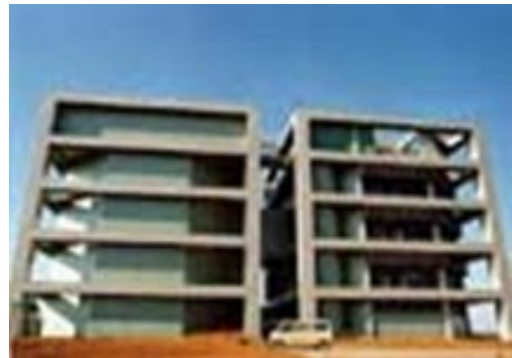
Figure 1: The NUR main building

Algeria has sufficient uranium resources to produce nuclear energy. On the southwest border with Niger, there is an estimated 56,000 tons of uranium that could be used to produce nuclear fuel. Between 1971 and 1998, the government undertook many activities to exploit uranium. This led to the discovery of deposits in Eglab, Ougarta and southern Tassili. These results were encouraging. However, between 1998 and 2001, the search effort declined progressively and since then, no real prospecting activity has been pursued (OECD and IAEA, 2005). In 1985, the Algerian Government announced that the very first Algerian research nuclear reactor would be built at Draria, on the eastern coast of Algiers (Kessler, 1989). The Argentine nuclear vendor Investigaciones Aplicadas ( INVAP ) was selected in alliance with a number of local engineering companies. Construction began in 1986. The 1 MW thermal power multipurpose reactor in Algiers named NUR ("luminosity" in Arabic) went critical and was inaugurated in April 1989. It took only 18 months to assemble. Its design is similar to Argentina's RA-6 reactor, but has significant improvements to its human interface capabilities.