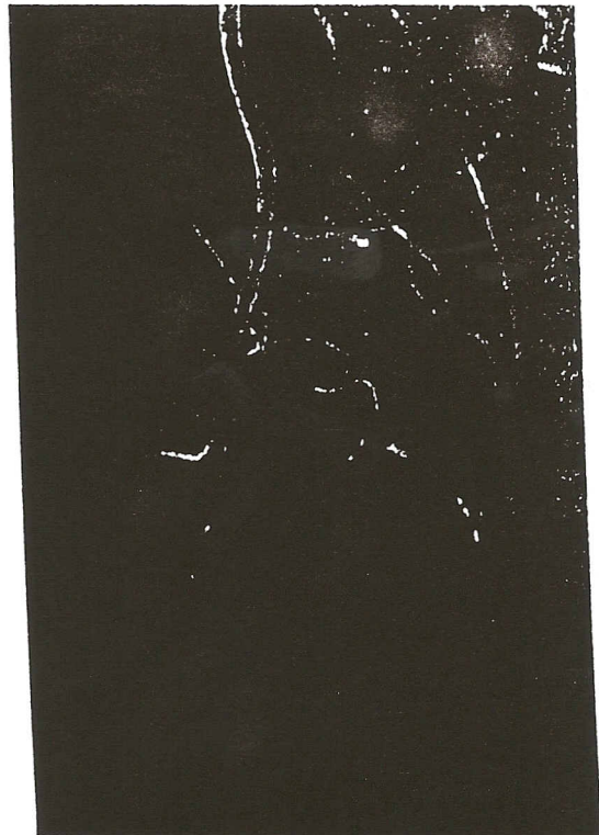
Figure 1 A pre-operative arteriogram of one of addicts showing a false groin aneurysm originating from common femoral artery.

was necessary in three patients to establish the clinical diagnosis, which had a high index of suspicion (Figure 1). Patients with ruptured femoral artery aneurysms were operated upon urgently in order to control life-threatening haemorrhage and to preserve arterial flow to the affected limb. The standard approach in this department is to start the operation by exposure of the external iliac artery through an extraperitoneal approach, as a preliminary to an extra-anatomical bypass with ringed PTFE. The popliteal artery above the knee is then exposed via a medial incision. During the vascular exposures, the groin aneurysm is compressed if required, by an assistant until the external iliac and the popliteal arteries are cross-clamped. A PTFE 8-mm ringed graft is 'tunnelled' below the fascia of the anterolateral aspect of the thigh to emerge between the sartorius and the vastus medialis at the level of the